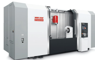
DMG MORI NT5400/1800SY PRODUCTION MILLING MACHINE 5 axis mill-turn with lower turret

X: 41.3"/1,050mm Y: 35.4"/900 mm Z: 40.6"/1,030mm