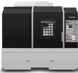
DMG MORI DURAVERTECAL 5100 PRODUCTION MILLING MACHINE 3 axis vertical

X: 17.7"/450mm Y: 3.94"/100mm Z: 51.2"/1,301mm