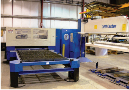
(2) TRUMPF TRUMATIC L3050 & L3030 (2) TRUMPF LIFTMASTERS – auto loading & unloading