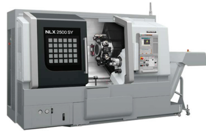
DMG MORI NXL 2500/700SY FOUR AXIS LATHE 4 axis machining center and 48" bar feeder

X: 17.7"/450mm Y: 3.94"/100mm Z: 51.2"/1,301mm