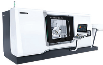
DMG MORI CTX BETA 1250TC MILL TURN 5 axis mill turn

X: 10.2"/260mm Y: 31.3"/795mm Z: 28.6"/728mm