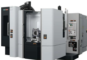
DMG MORI NHX6300 PRODUCTION MILLING MACHINE 4 axis horizontal machining center

X: 41.3"/1,050mm Y: 35.4"/900 mm Z: 40.6"/1,030mm