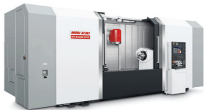
DMG MORI NT5400/1800SY PRODUCTION MILLING MACHINE 5 axis mill-turn with lower turret X: 40.9"/1,040mm Y: 10"/255mm Z: 76.4"/1,940mm