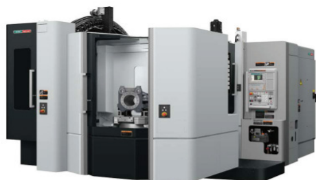
DMG MORI NHX6300 PRODUCTION MILLING MACHINE 4 axis horizontal machining center X: 41.3"/1,050mm Y: 35.4"/900 mm Z: 40.6"/1,030mm