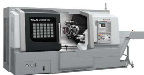
DMG MORI NLX 2500/700SY PRODUCTION MILL TURN 4 axis machining center and 48" bar feeder X: 10.2"/260mm Y: 31.3"/795mm Z: 28.6"/728mm