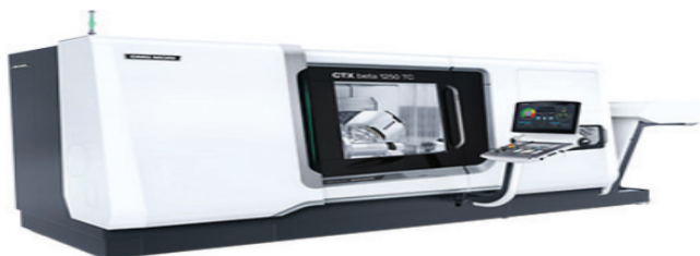
DMG MORI CTX BETA 1250TC MILL TURN 5 axis and 60" bar feeder X: 17.7"/450mm Y: 3.94"/100mm Z: 51.2"/1,301mm