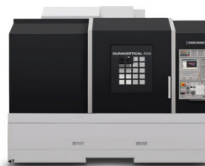
DMG MORI DURAVERICAL 5100 PRODUCTION MILLING MACHINE 3 Axis vertical X: 17.7"/450mm Y: 3.94"/100mm Z: 51.2"/1,301mm