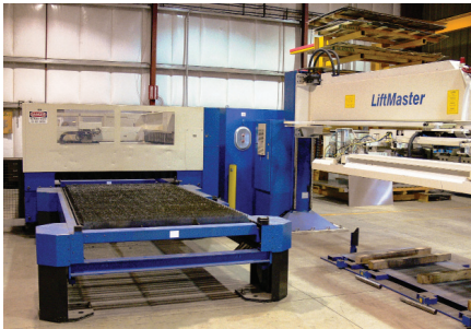
(2) TRUMPF TRUMATIC L3050 & L3030 (2) TRUMPF LIFTMASTERS – auto loading & unloading