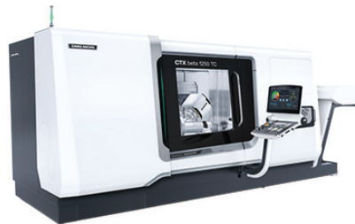
DMG MORI CTX BETA 1250TC MILL TURN 5 axis mill turn

X: 10.2"/260mm Y: 31.3"/795mm Z: 28.6"/728mm