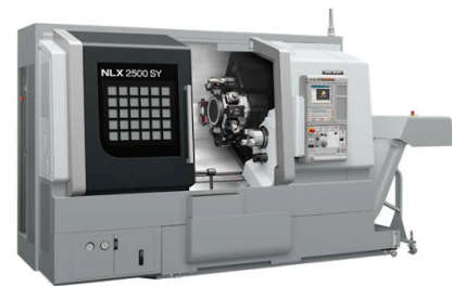
DMG MORI NLX 2500/700SY FOUR AXIS LATHE 4 axis machining center and 48" bar feeder

X: 17.7"/450mm Y: 3.94"/100mm Z: 51.2"/1,301mm