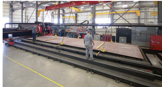
KINETIC K5000 XMC Combination Drilling & Cutting • Drills 4" diameter holes in 8" thick plate • Plasma torch with production cutting of 2" mild steel • Plasma and oxygen bevel cutting up to 45 degrees • Maximum width 10' and length of 40'

The Kinetics automatic 24 tool changer and combo plasma/flame bevel, with marking system and multiple torch stations can do a variety of jobs: drilling, marking, milling, cutting, bevel cutting and counter boring.